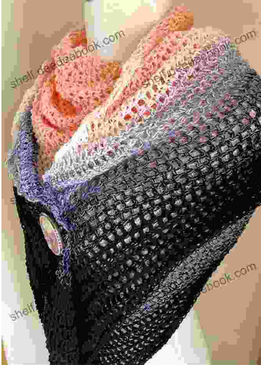
A colorful crochet shawl with a geometric pattern.