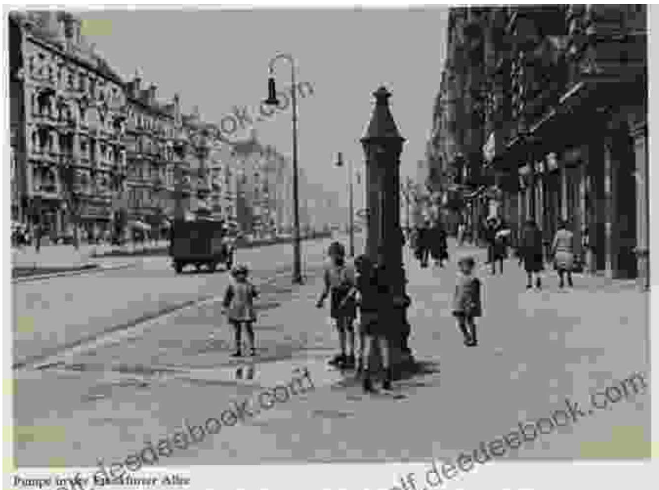
Jump to the main menu