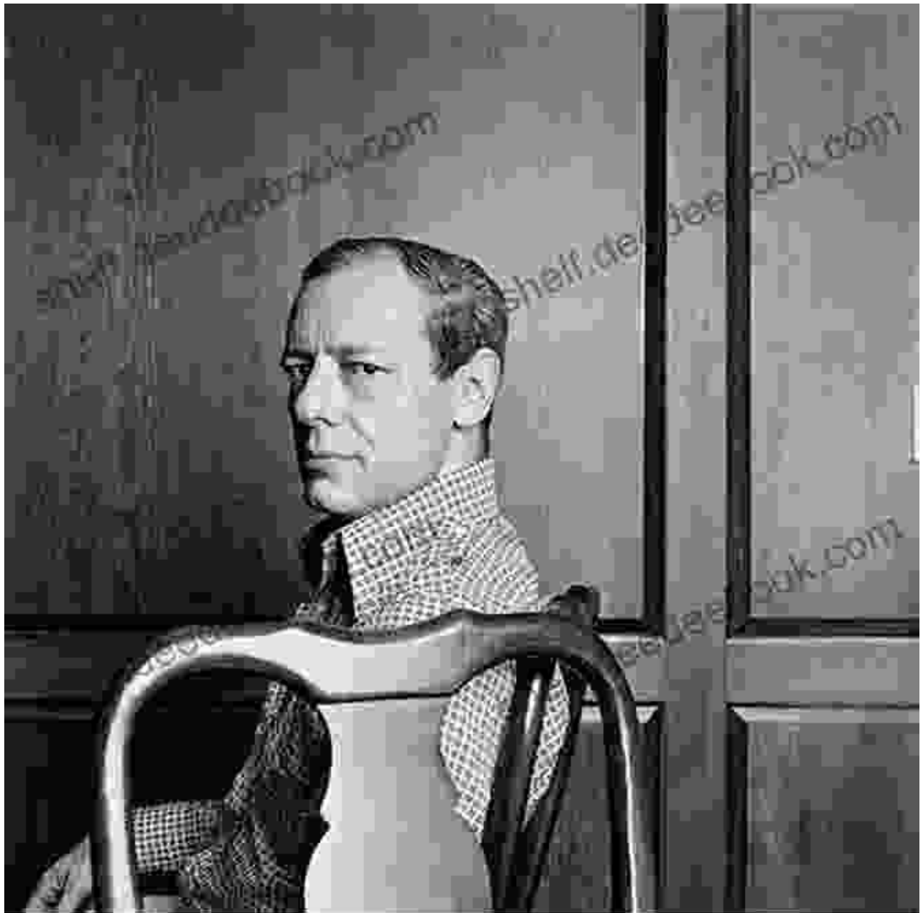
John Simon on Film: Criticism 1982-2001 (Applause Books) by Glenn Meyer