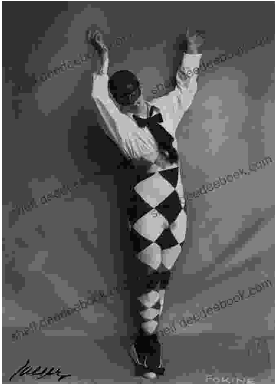
Michel Fokine, a pioneer of modern ballet

While the Classical Revival emphasized preservation, it also paved the way for modernization and innovation. Choreographers began to explore new choreographic styles and movements, pushing the boundaries of classical technique.