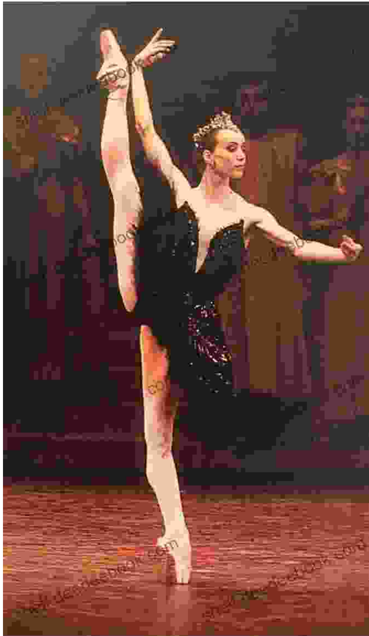
Sylvie Guillem, a renowned ballet dancer

Rudolf Nureyev, a legendary dancer and choreographer, bridged the gap between classical ballet and modern dance. His virtuosic performances and groundbreaking interpretations of classical roles left an indelible mark on the art form.