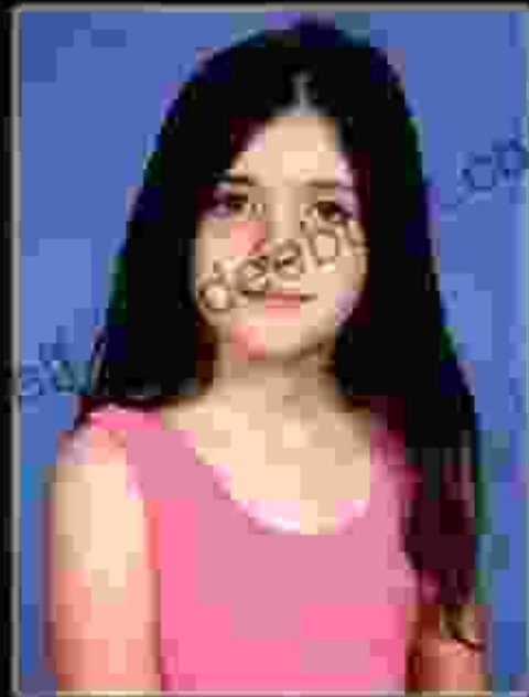
Jacksonville State Attorney